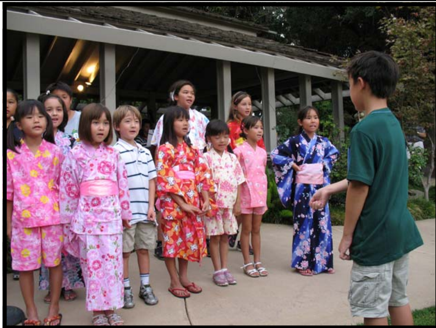
Children from the Central Valley Japanese School entertained attendees of the Annual Dinner with their music.