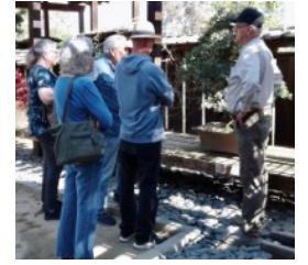
Take a docent led bonsai tour