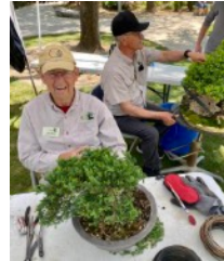
Watch bonsai demonstrations