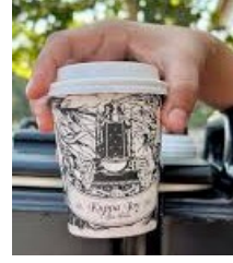
Have a delicious Koppa Joy Coffee