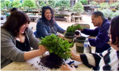
Take a bonsai making class at 11am for $60

COME CELEBRATE WORLD BONSAI DAY, SATURDAY MAY 11! (Page 2)