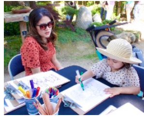
Draw or color bonsai